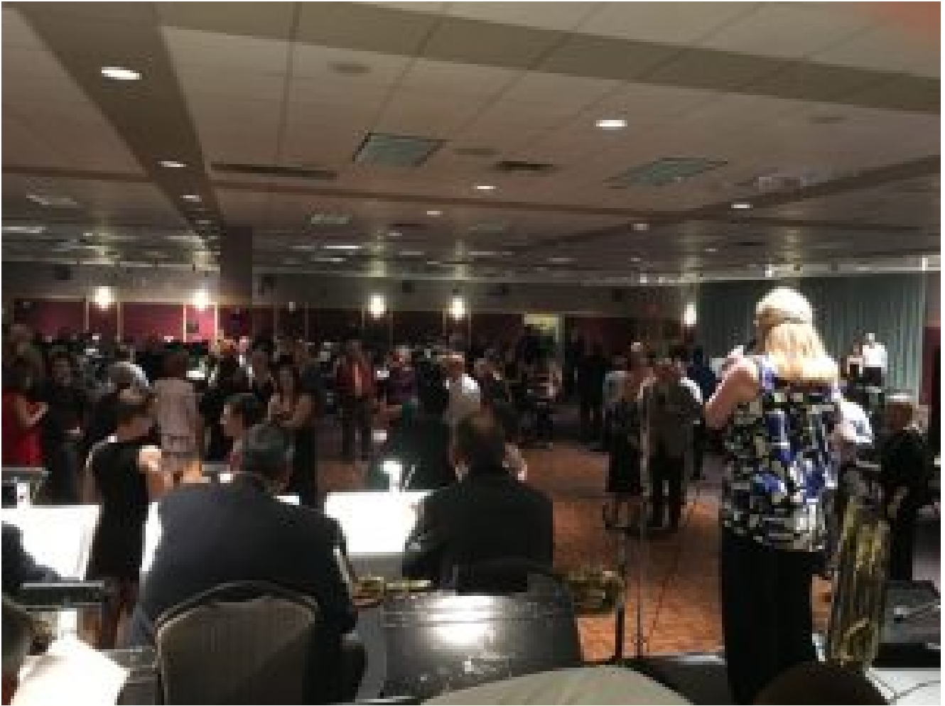
Otsego Jazz Ensemble at the WMU Senior Prom, 2016