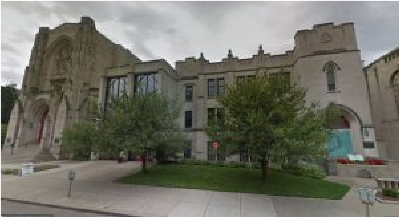
First Presbyterian Church

The Otsego Jazz Ensemble brings a great variety of American music to Kalamazoo's First Presbyterian Church on Friday, October 5 th at 6:30pm. It's on the same day as the October Kalamazoo Art Hop. Come after and during Art Hop and enjoy an evening of big band music with the Otsego Jazz Ensemble.